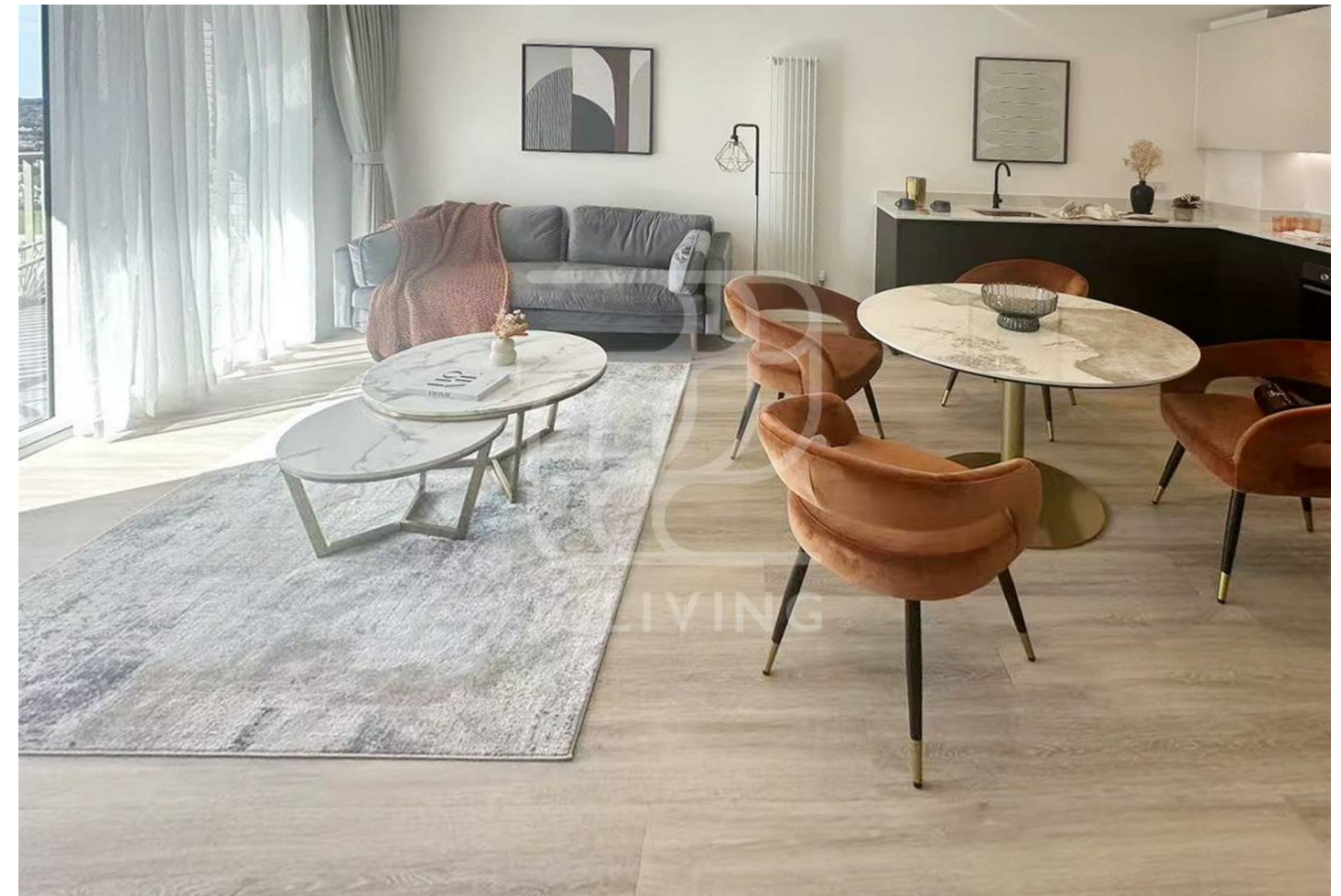
One Bedroom 一居室公寓